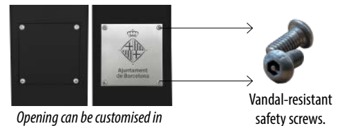
Opening can be customised in lacquered or stainless steel.