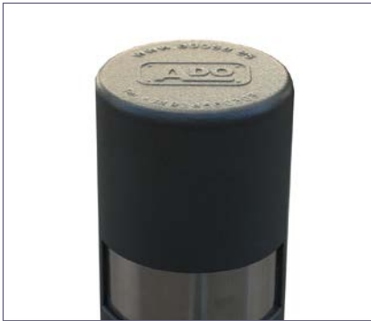
Engraved detail of the logo on the bollard.