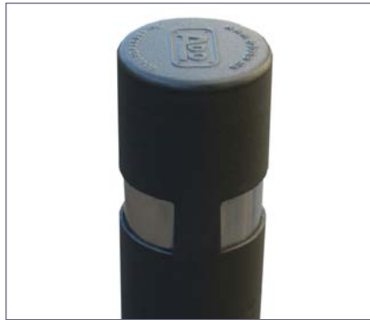
Bollard reinforcement detail avoiding top break.