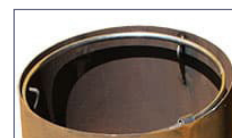
Bag holder inner ring.